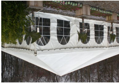
Maximum Capacity per Tent Size: